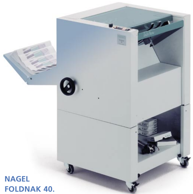
NAGEL FOLDNAK 40.