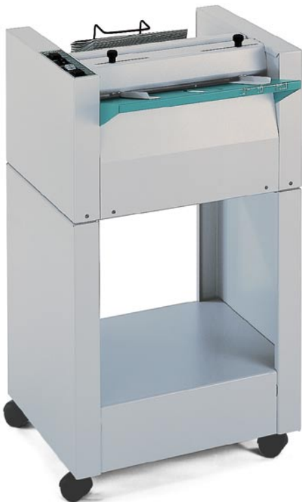
NAGEL FOLDNAK M2.

■ Working in conjunction with the Nagel collator or friction tower collators by other manufacturers, the Nagel Foldnak 40 can produce up to 1,500 booklets per hour – reliably, precisely, and in the well-known Nagel quality.