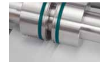
Book cover creasing